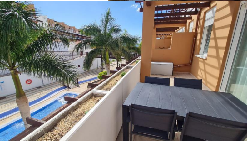
Pool view from balcony