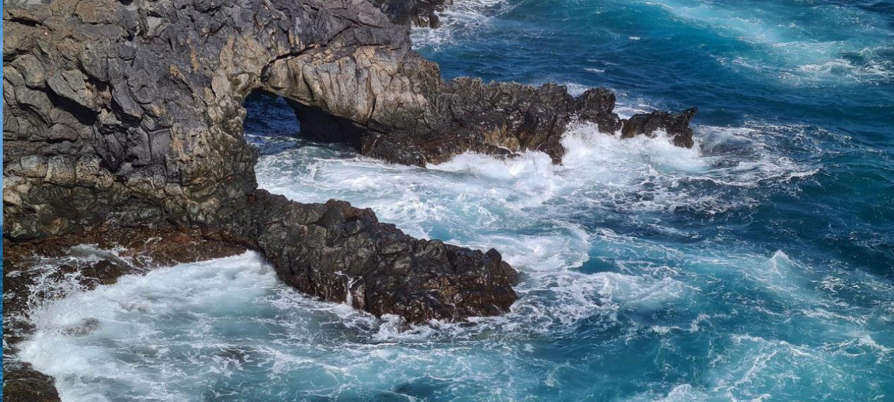
Surrounding of Amarilla Golf