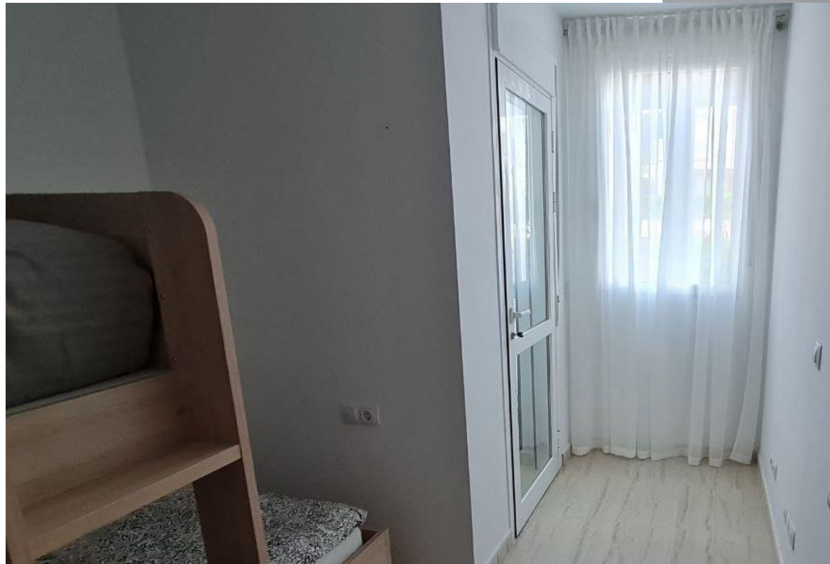
Bunk bed 190x90