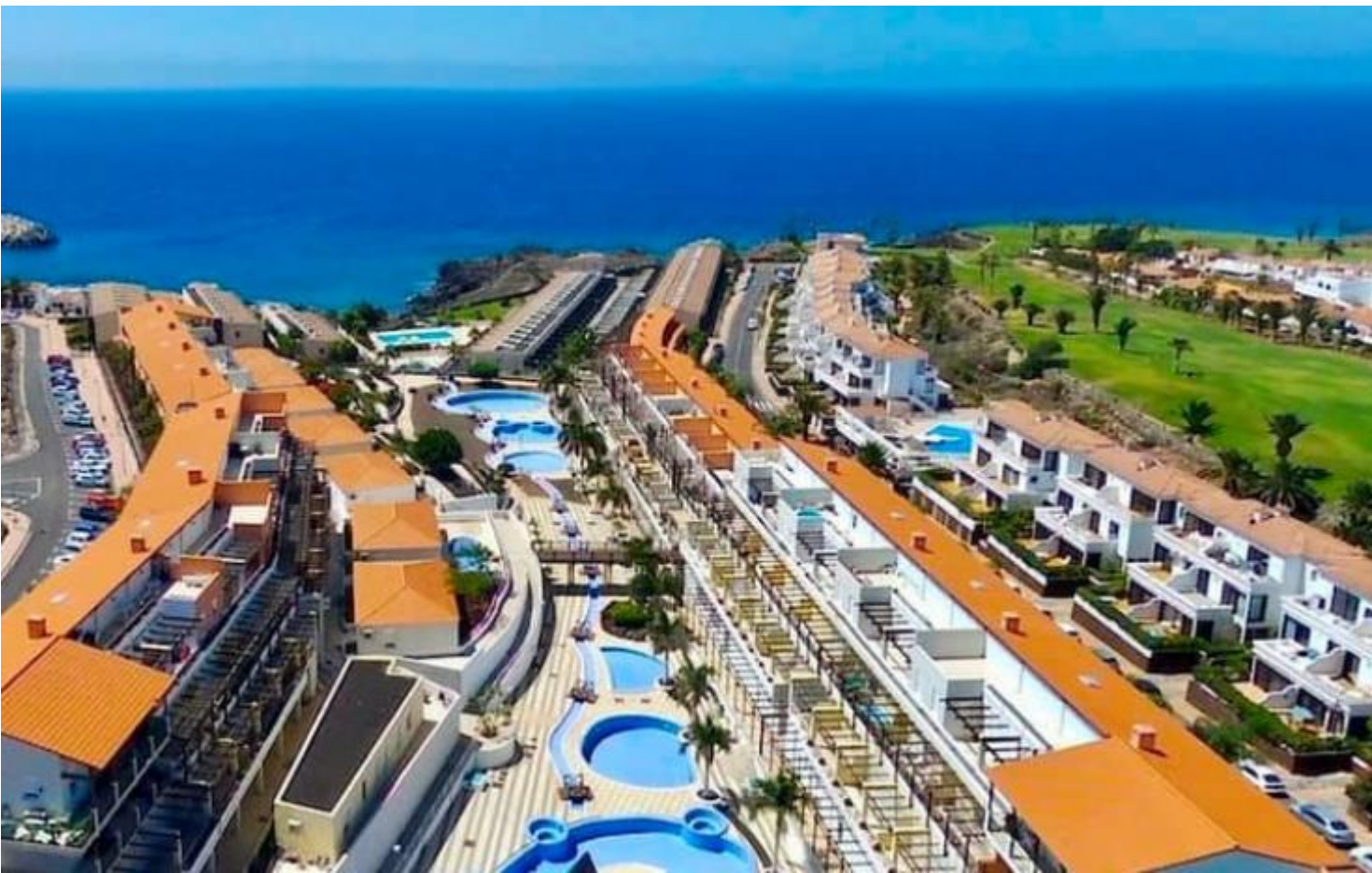
Amarilla Golf Club